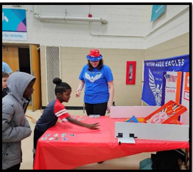
Dayton Area Pathfinders