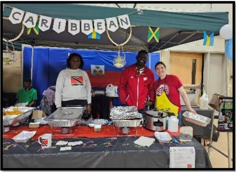
Bahamas, Dominica, Guyana, Hati, Jamaica, Trinidad Tobago...