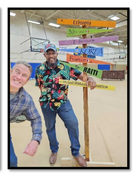
One of these does not look like the others! You never know who is about to photo bomb ya. 😊