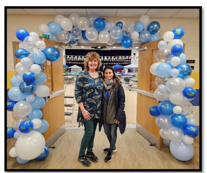
Proudly showing their heritage! / Saturday night helpers did an amazing job.