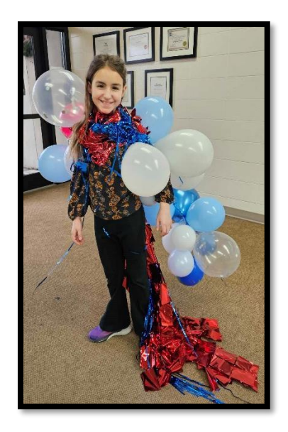
When the decorations are just so beautiful you have to wear them home.