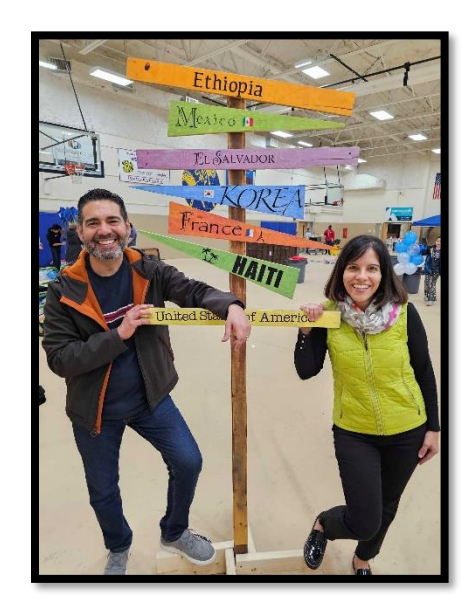
The couple who created of our gorgeous sign!