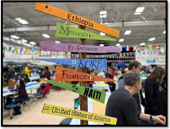
SUNDAY - LET THE FUN BEGIN!

I'm imagining these two telling people, "Show me your money – dinero – 돈 – dinheiro – деньги – uang – lajan – kālā – pera – argent - wang…!"