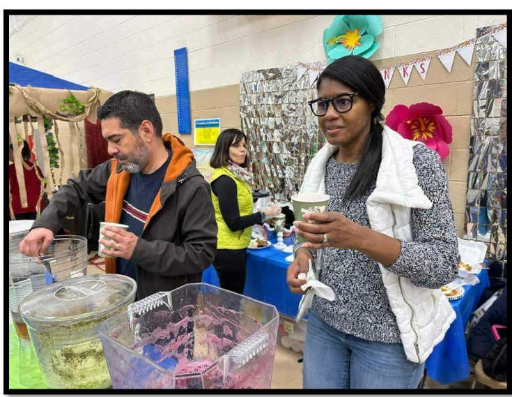
Drinks were so delicious.