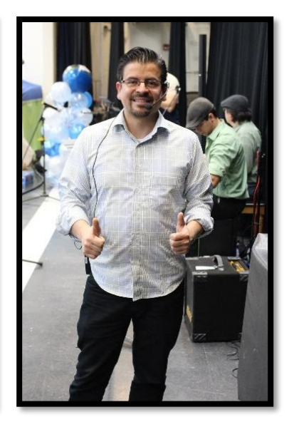
Our wonderful live music