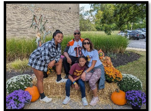
Beautiful families were spotted everywhere!