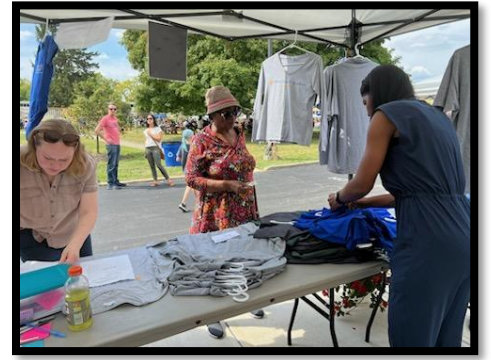
Let the fun begin!