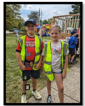
Elementary Library Booth came out strong for their 1 st time. Found a 5k winner for her age category...and every jail needs some good bounty hunters!