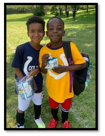
Friendships are being made and growing stronger each game!