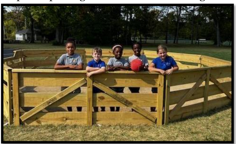
It is now a favorite recess pastime for all ages.