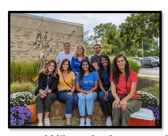
Link to Fall Fest Photos Below 2023 Fall Fest