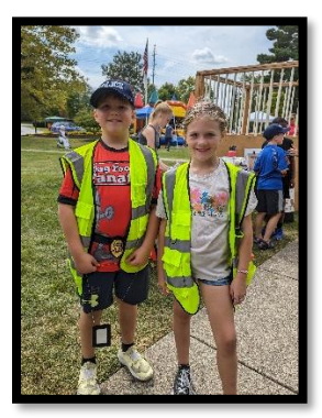
Elementary Library Booth came out strong for their 1st time. Found a 5k winner for her age category...and every jail needs some good bounty hunters!