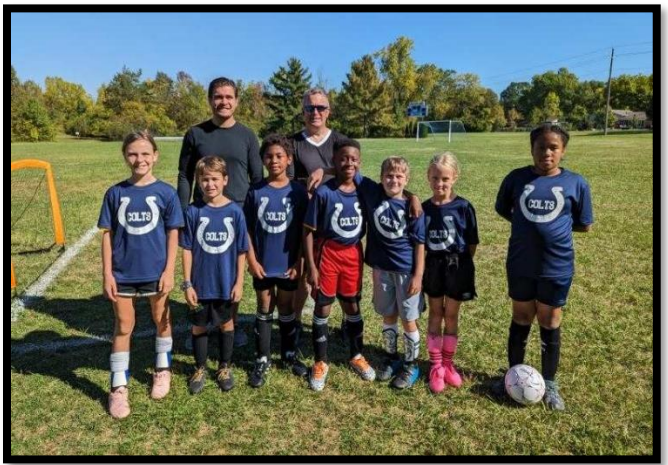
Sometimes you're yellow and sometimes you are blue!