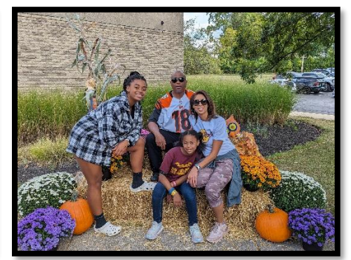
Beautiful families were spotted everywhere!