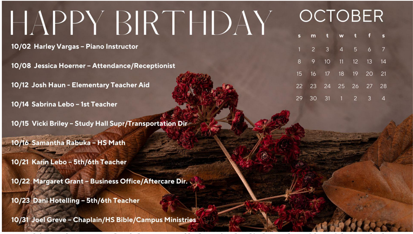
Speaking of our wonderful SVA staff...here's the link to the gift guides to help us show them how special they are throughout the year.