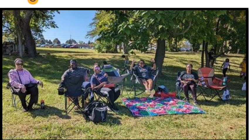
I think some spectators on the sidelines have just as much fun as the kids do!