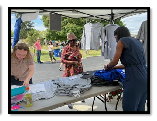
Let the fun begin!